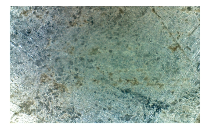
Fig. 4. Micrograph of the film deposited on lead substrate