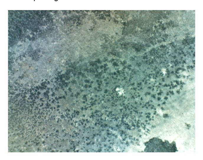
Fig. 3. Micrograph of the film deposited on zinc substrate

The topographical characterization of the films deposited was studied in order to determine the small changes in the surface contour of films (lattice surface defects) like dislocations, stacking faults, etc as well evaluating the whole image field. In Figs. 3 and 4 are shown the micrograph of the films deposited on zinc and lead substrates respectively. From Fig. 3, it is deduced that the crystals are compact and have a good agglomeration than those on lead substrate. This could be because zinc is higher up than lead in the electrochemical series hence more effective in displacing silver from the solution.